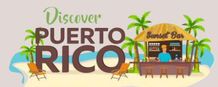
Trip Logo for promoting the trip

*After deducting manufacturer co-op support